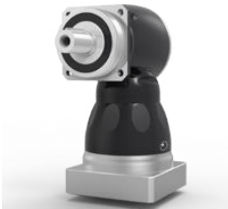
KF S1 / S2